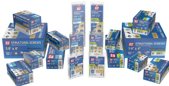
NEW — Grip-Rite Structural Screws Peg hooked clamshells, 50 pc. boxes, 150-200 pc. boxes, and bulk packaging. Actual quantities may vary based off screw size

The newest fastener launch from the brand you know and trust, Grip-Rite Structural Screws offer versatility, speed and longevity in load-bearing exterior wood construction projects. Both styles include an ID code stamped right into the head for easy spec reference and a load value chart conveniently located on every package. As a replacement for lag screws, Grip-Rite Structural Screws feature a type 17 point that translates to both efficiency and time savings by eliminating the need to pre-drill pilot holes. Our premium PrimeGuard Plus coating assures Grip-Rite Structural Screws will last throughout a project's lifetime. Easily identifiable, cobalt blue packaging features easy to read iconography, lateral load value references and a scannable QR code that links directly to the ICC report for technical specifications.