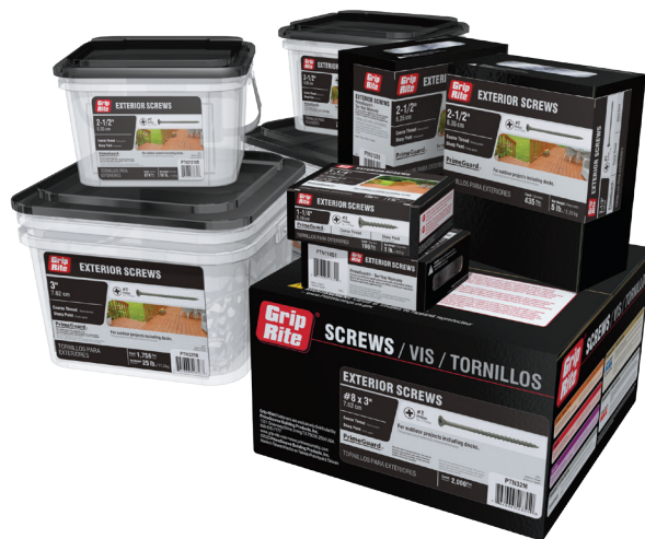
Grip-Rite Exterior Screws with PrimeGuard® 10 coating Available in 1lb., 5lb., 10lb., 25lb. and bulk packages

Grip-Rite exterior screws with PrimeGuard coating are a reliable choice for contractors and DIYers who want quality and value from a brand they know and trust. With a Phillip's head, coarse thread and a sharp point, all wrapped in a 10-year coating warranty, this fastener is ideal for use in treated lumber projects.