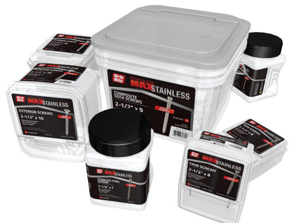
NEW — Grip-Rite PrimeGuard MAX® STAINLESS Available in clamshells, jars, 1lb., 5lb., 25lb. and bulk packages

When nothing but the best will do, Grip-Rite MAX Stainless screws are the preferred premium exterior construction fastener on jobsites – especially those located in areas with high humidity, around pool areas or near the coasts. Grip-Rite 305 and 316 grade stainless steel screws are ideal for fastening decking, siding, roofing, finish and trim and are the best choice for use in cedar and redwood construction. Deep cut threads and star drive heads are standard on all Grip-Rite MAX Stainless Exterior Screws, increasing holding power and quick engagement for a solid connection.