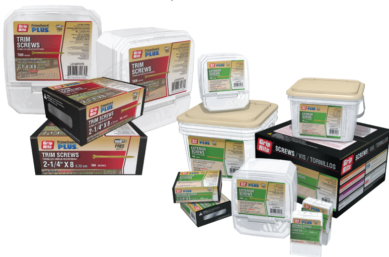
Grip-Rite PrimeGuard Plus® Exterior Coated & Trim Head Screws Available in clamshells, 1lb., 5lb., 10lb., 25lb., and bulk packaging

Grip-Rite Exterior Trim Head screws feature a T20 star drive trim head suited to materials used in exterior finish work.