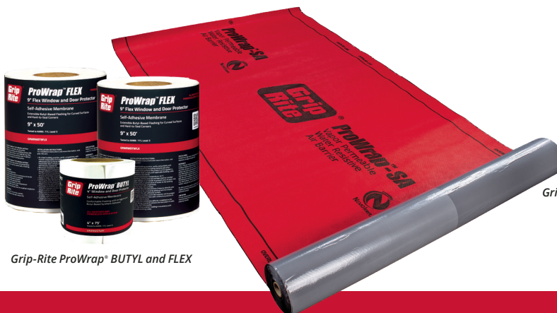
Grip-Rite ProWrap® BUTYL and FLEX

NEW Grip-Rite ProWrap®-SA Complete system for both Residential and Commercial weather resistive applications with an industry-leading warranty.