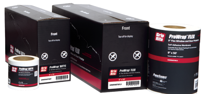
Grip-Rite ProWrap® BUTYL

For More Information on Weather Resistive Barriers Scan the QR Code