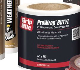
Grip-Rite ProWrap® BUTYL