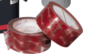
Grip-Rite® House Wrap Tape

For warranty submissions visit www.grip-rite.com/resources/warranty