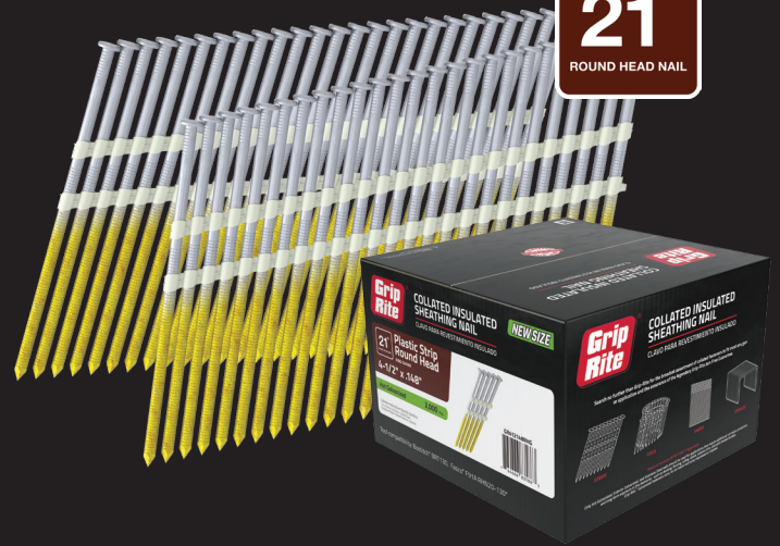
SpeedSpike™ – 4½" x .148" (Plastic Collated)